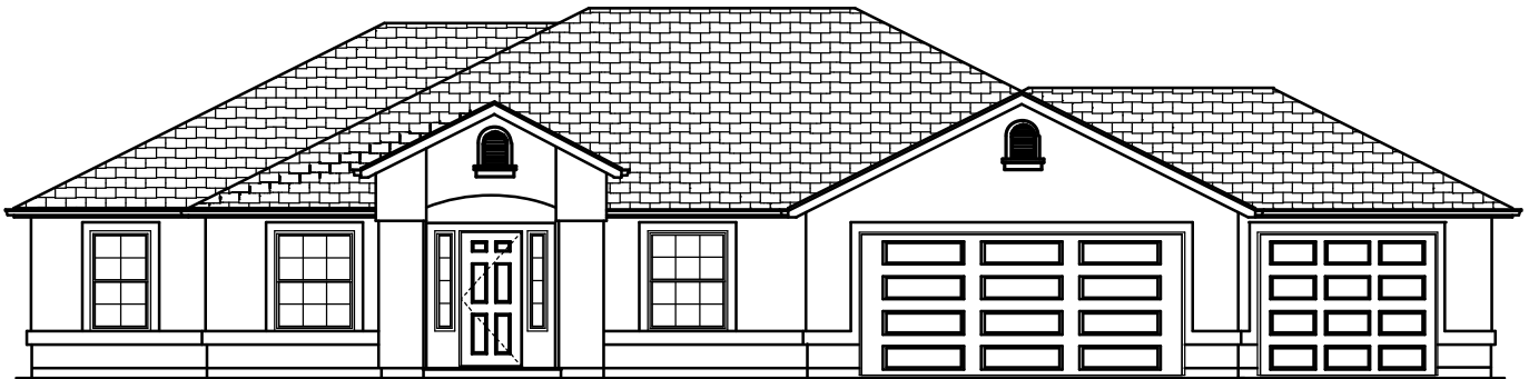
FRONT ELEVATION 1B - SHOWN W/ OPTIONAL 3RD. CAR GARAGE