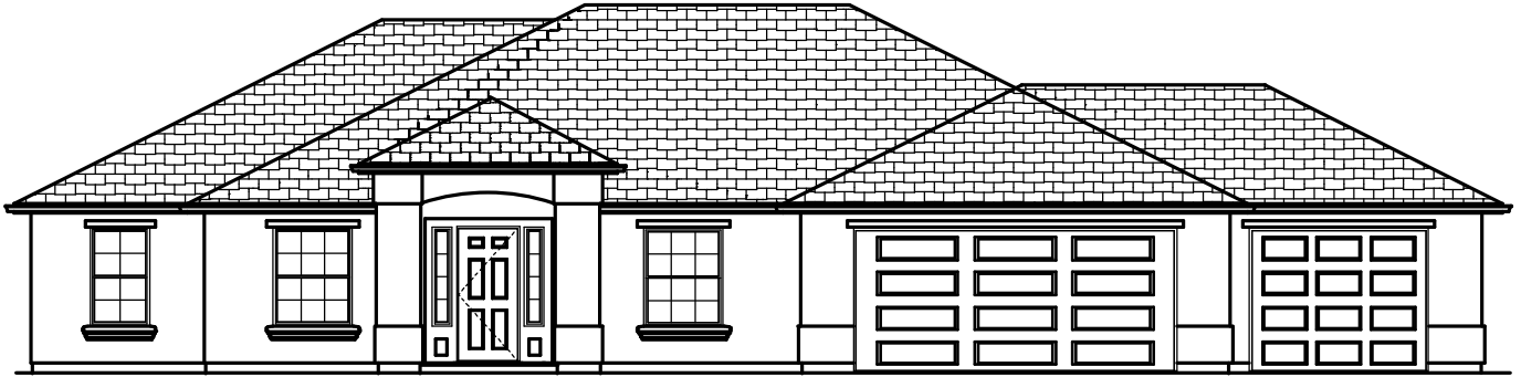
FRONT ELEVATION 1A - SHOWN W/ OPTIONAL 3RD. CAR GARAGE