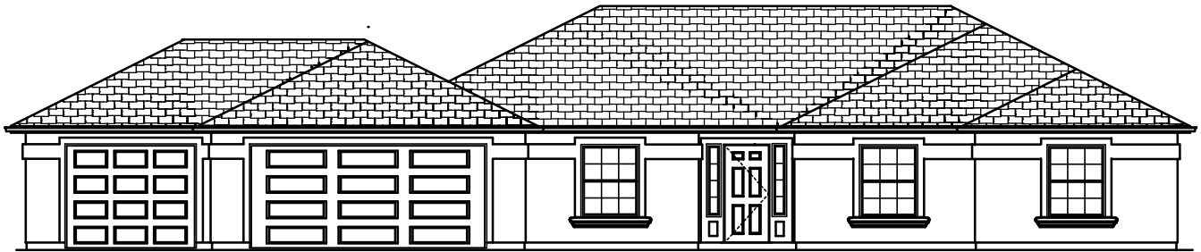
FRONT ELEVATION 1A - SHOWN W/ OPTIONAL 3RD. CAR GARAGE