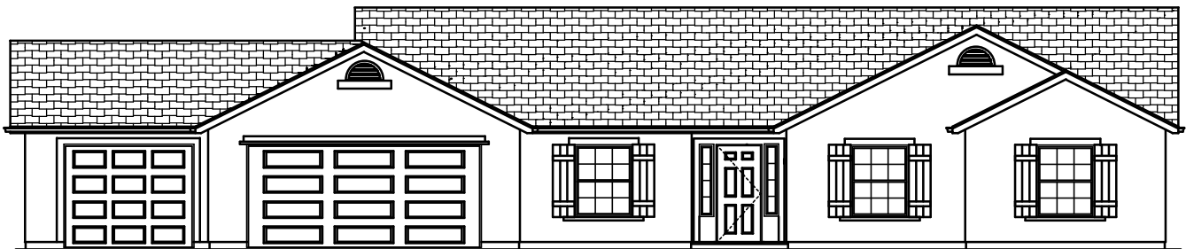
FRONT ELEVATION 1B - SHOWN W/ OPTIONAL 3RD. CAR GARAGE

The Birchwood 3 Bedroom, 2 Bath, 1760 SQ.Ft.